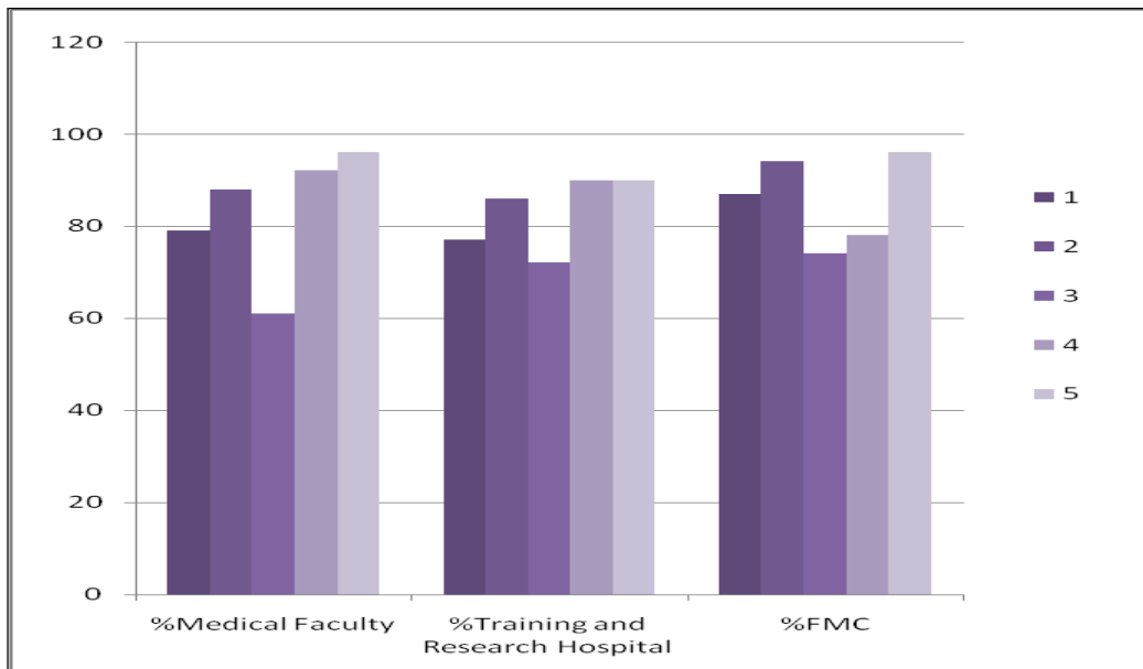
Figure 2. The positive scores according to the working places of the participants