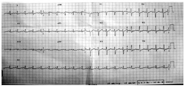
Figure 1. The patient's derived 12-lead ECG.

ventilator support with positive end expiratory pressure (PEEP) was provided to the patient. Hyperbaric oxygen treatment was unavailable in our region. After 24 hours, the patient's ABG values improved. Her pO<sub>2</sub>/FIO<sub>2</sub> ratio was measured as 425.8 mmHg. In the second day of hospitalization, a clear improvement was observed on the chest x-ray (Figure 2b). She was weaned off mechanic ventilator due to clinical improvement and then she was extubated. Troponin I peaked to 0.60 on the second day, and began to decrease afterwards. As her improvement was early, she was diagnosed as acute lung injury. Her blood cultures were negative and bronchoalveolar lavage showed normal flora. She was discharged without any complication on the seventh day of hospitalization. On the follow up after one month, no neuropsychological sequela was observed.